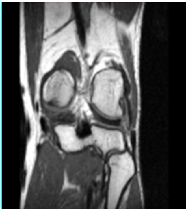
Figure 1 Coronal T1 weighted image showing a mild inflammation within the popliteus tendon course, but not clear signs of tear.

were both negative. There were no further signs of meniscal pathology. The range of motion was unremarkable, with no instability to varus or valgus stress at 0° or 30° of knee flexion. Furthermore non signs of posterolateral rotatory instability were possible to elicit. MRI showed a mild inflammation around the popliteus tendon with no specific sign of rupture, (Fig. 1). The patient underwent a diagnostic arthroscopy approximately four weeks after the trauma due to the lack of results with a prior conservative treatment. At the time of surgery, a complete examination under anaesthesia showed normal knee laxity under manual laxity tests with no signs of rotatory instability. Arthroscopic examination was carried out with a standard anterolateral and anteromedial portals and revealed a partial popliteus tendon rupture just above the hiatus, (Fig. 2). The anterior fibers of the tendon were torn and a small stump was visible. The examination of the hiatus did not show the presence of a distal stump. There was no meniscal or cruciate pathologic conditions. In order to check the mechanical efficiency of the tendon and with the plan of performing an augmentation of the tendon if necessary, an open approach was performed that confirmed the presence of a partial tendon tear. The tendon was tested with