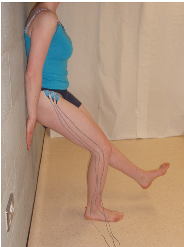
Figure 2 Subject performing the wall squat (WS) exercise.

During the WP exercise subjects also wore the velcro jacket for ease of movement. Subjects were asked to stand next to a wall with the right limb furthest from the wall. They were then asked to assume a single leg stance position by flexing their left hip to 60 degrees and their left knee to 90 degrees, using goniometric measures. The medial aspect of the right foot was positioned 20 cm from