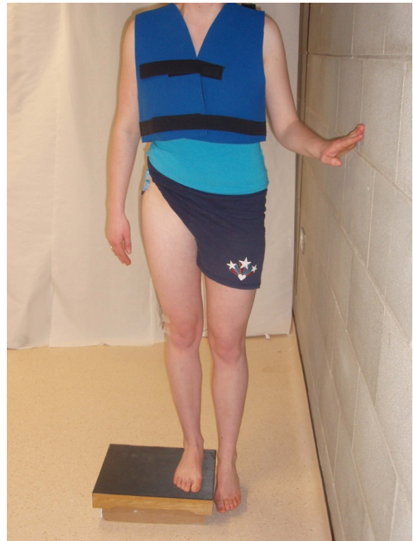
Figure 3 Subject performing the pelvic drop (PD) exercise.

the wall (Figure 4). Subjects were asked to maintain this position while concurrently maximally pushing their left knee, leg and ankle against the wall. They were not specifically asked to contract their right hip muscles. Subjects kept their trunk in a vertical alignment and their pelvis level throughout the exercise [5]. Subjects maintained this isometric contraction for five seconds during each trial. Prior to testing subjects were given three practice trials of each exercise for familiarisation purposes during which any subject performance errors, including pelvic rotation or tilting, were corrected. Subjects performed three repetitions of each exercise, with a 30 second rest period between trials and a one minute rest period between exercises to reduce the possibility of fatigue [9]. The order of exercises was randomised. During data collection, EMG signals were monitored on the computer screen. EMG data were analysed over the entire five second period for all MVIC contractions, as well as for the WS and WP exercises. For the PD exercise, the entire four seconds was analysed with no differentiation between the concentric and eccentric components, as patients normally complete both components together as part of their rehabilitation programme. The EMG data were then full-wave rectified and processed using a root-mean-square (RMS) algorithm over 150 milliseconds [40]. The mean RMS amplitude for each subdivision over