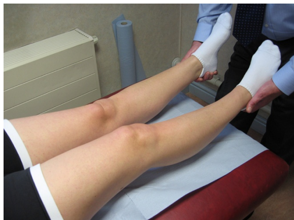
Figure 1 Passive elevation of both legs off the examination couch, with the examiners hands beneath the patient's heels allowing knee extension to be determined. Knee locking is the acute inability for the knee to fully extend.

The patients included had all sustained an acute knee injury and subsequently had an acute inability to fully extend the knee both actively and passively. No threshold was set for the degree of fixed flexion deformity, the only criteria was that it had occurred acutely and was different to the non-injured side. The knee was then specifically assessed for extension noting the presence of the stump impingement reflex by placing a hand beneath each heel and gently lifting both legs simultaneously (Figure 1). The knee extends against gravity and is observed for range and pattern of movement looking particularly for the subtle flexion or "bounce" of the Stump Impingement Reflex (Test results). It is our routine practice for these patients to undergo urgent arthroscopy to permit full extension of the knee to be restored.