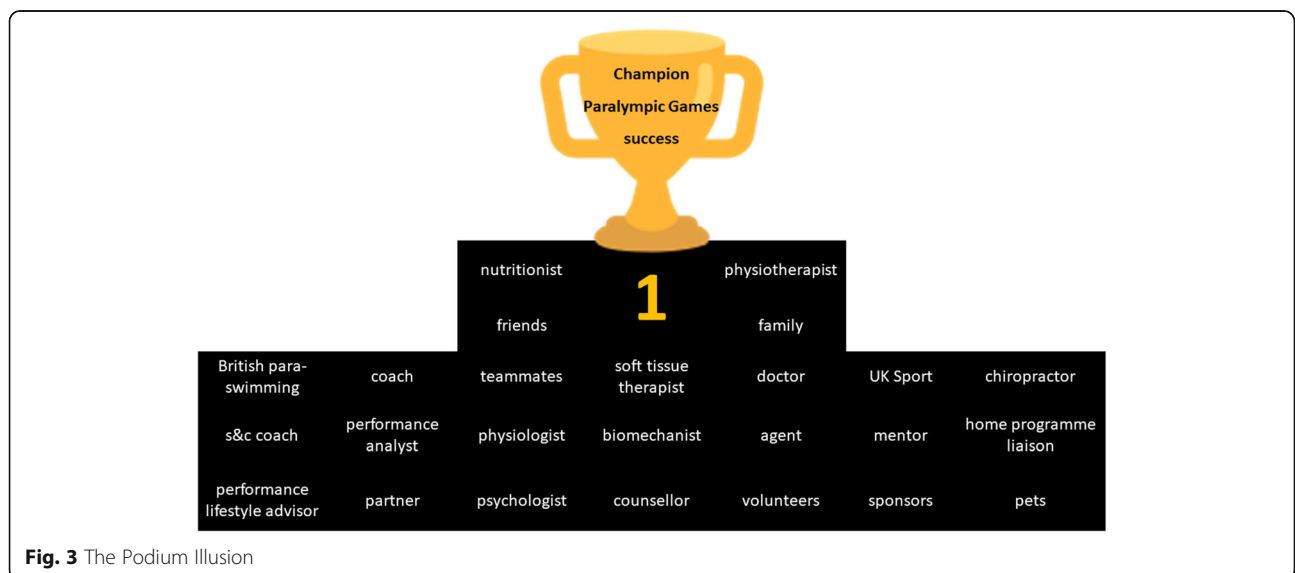
Fig. 3 The Podium Illusion

Coaches provided emotional support through being approachable, a good listener and expressing caring, which are indispensable components of the coach-athlete relationship [49]. A coach's ability to inspire and motivate their athletes was valued, with participants experiencing increased levels of self-esteem, and improved overall wellbeing and performance with a supportive coach. This support was vital, as high confidence levels are linked with improved performance in Olympic athletes [23]. Participants received informational support