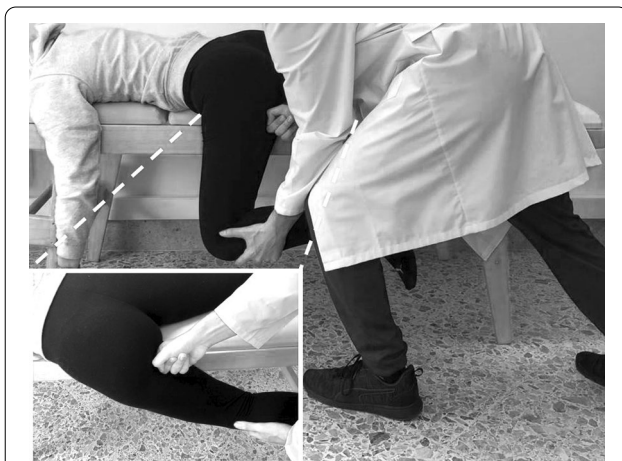
Fig. 2 Representation of the Positional Transversal Release technique. The main scheme depicts the positioning of the participant and positioning of the operator. The box on the left lower aspect of the scheme depicts the positioning of the hand of the operator on the myotendinous junction of the hamstring muscle of the participant

A priori sample size calculation was performed through G-power (G*Power version 3.1.9.4, ES = 0.3 , 1 - \beta = 0.80 , \alpha = 0.05 ) which defined as 32 the minimum number of participants required for the planned research model. Data are presented as means and standard deviations. Inferential statistics were carried out with Jamovi (The jamovi project (2021). jamovi (Version 1.8.0.1) [Computer Software]. Retrieved from https://www.jamovi.org ). A Shapiro–Wilks test was performed to identify the normality of the distribution of all parameters. Repeated Measures Analysis of Variance (ANOVA) was performed for each measure using a 3 \times 4 model to identify time and group interactions. Post-hoc Bonferroni corrections were performed to identify differences between the